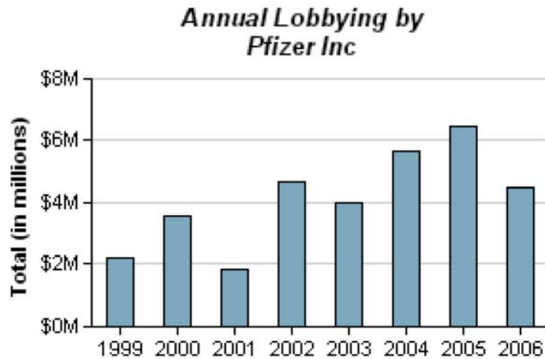
FIGURE 1: ANNUAL LOBBYING BY PFIZER (1999 – 2006)